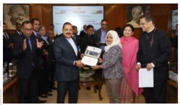
The Capacity Building Programme conducted during the year 2019-20 is listed at Annexure III.

Since the MoU signed NCGG has conducted 5 Capacity Building Programme on Public Policy & Governance including a Capacity Building Programme for the Permanent Secretaries and Secretary Generals of Maldves. 130 Civil Servants have been trained so far.