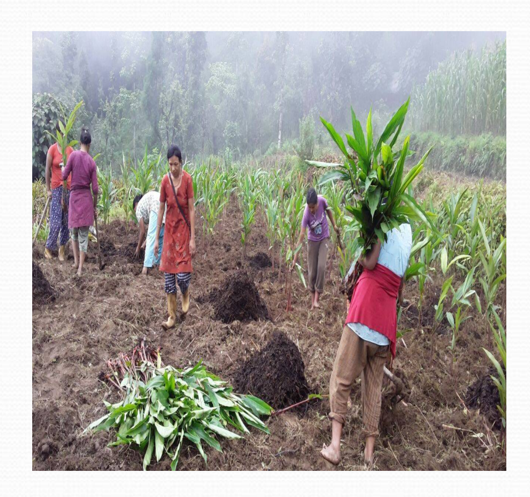
Planation of Cardamom Seedlings convergence with MGNEGRA