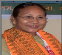
Smt. Pramila Rani Brahma Minister of State Department of Environment and Forest

** This portal is under continuous development and is being upgrd