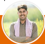
Mining e-Services For Citizens