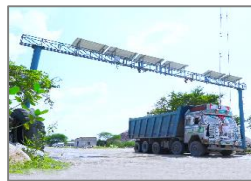
AI & IoT based unmanned Checkgates installed on all major mining routes

MINETag issued to Mineral Carrying Vehicles