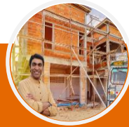
UP Mineral MART Lessee/Stockist, Transporters, Government Construction Agencies and Consumer