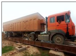
PTZ Cameras & weighbridges in mines