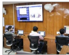
Unified Revenue Command Center with DSS at DGM