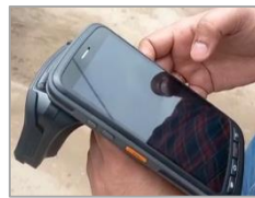
RFID handheld reader & mCheck app with all district mining officers