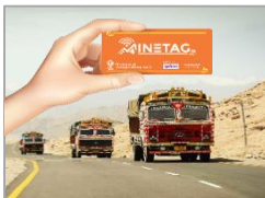
MINETag installed on mineral carrying vehicles