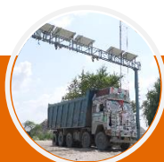
Smart Enforcement System For Directorate, DM, MO, Lessee/Stockist & Transporters