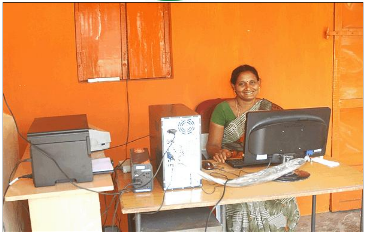
Department of Information Technology and Communications, Government of Andhra Pradesh