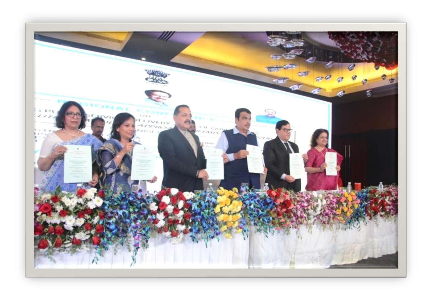
Nagpur Conference Resolution